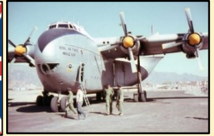
Royal Air Force